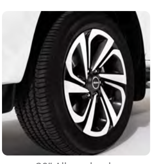
20" Alloy wheels