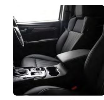
French-stitched leather upholstery in black