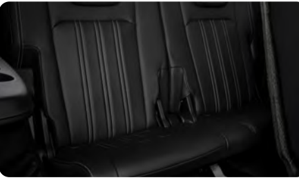
Additional lumbar support and softer cushioning on seats.

Once you get used to the standard of luxury and refinement on offer, don't be surprised to find yourself wanting to spend more time behind the wheel of the new ISUZU mu-X.