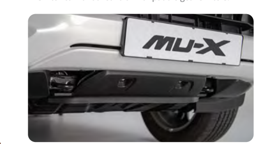
Steel sump & transfer case guard* protect the underbody