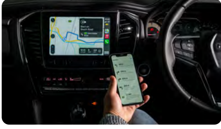
Class-leading, 9-inch screen**, ISUZU Infotainment Syste

Another technology win for the new ISUZU mu-X is adaptive cruise control*, which automatically maintains preset speed and distance from the vehicle ahead, while the stop and go feature maintains the settings for up to 5 minutes once motionless.