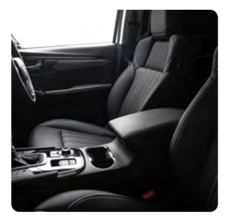
French-stitched leather upholstery in black

Available with a 3.0 Litre Turbo Diesel Engine mated with 6-Speed Auto Transmission and a 4X2 Drive Configuration.