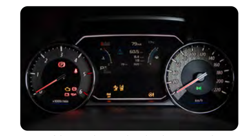
State-of-the-art, colour-graphics digital instrument cluster.