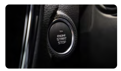
Passive entry/start system** with engine start/stop button