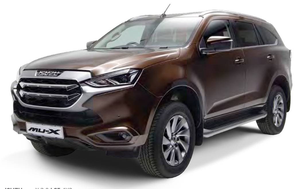
ISUZU mu-X 3.0 LSE 4X2 Colour: SANTOS BROWN

9" Touch Screen with RDS, MP3, Bluetooth® Audio Streaming with Integrated Mobile Handsfree & Rear View Camera, 6 Speakers, Apple CarPlay® & Android Auto, Wi-Fi. Includes a Multi Information Display.