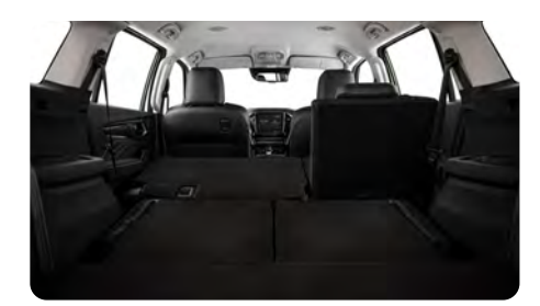
No shortage of space or flexibility.