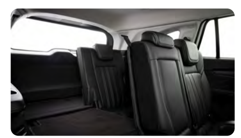
Intelligent, fold-away-flat seating configuration.